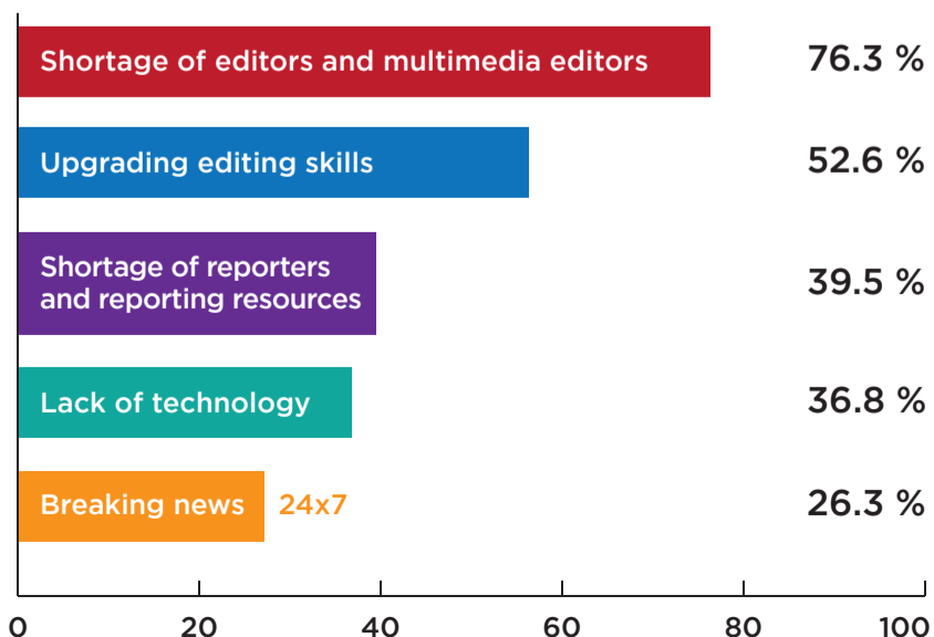
Chart 1: Pressing issues in newsrooms

The study showed that almost all publishers took some effort to control fake news. Many newsrooms have formed separate Desks for verifying news, some have tied up with external fact checkers like Altnews and some used the tools offered by Google to check fake news. If the news published was found to be fake, most publishers issued a