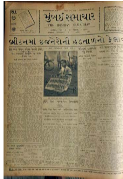
Mumbai Samachar April 03, 1937 edition

Meanwhile, Mid-day, an English tabloid based in Mumbai and a part of Jagran Prakash, celebrated its 40th anniversary with a 152-page 'Milestones Mumbai' special edition delivered in an exclusive paper bag.