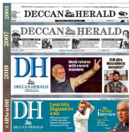
Deccan Herald masthead through the years.

on Mondays. On Sundays, there will be a new opinion page that is named 'The Prism.' On the supplement front, the newspaper has announced a new enter-