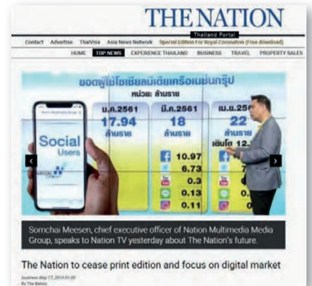
Screenshot from nationmultimedia.com

The multi-channel editorial system Content-X will allow the ABP Group to use its print and media channels equally effectively. The media-neutral content recorded in the digital asset management system DC-X, which is already in use at ABP, can now be exploited through various channels with a range of alternative stories. The self-service portal AdSelf lets agencies and users book classified ads and manage them online. Billing and other transactions are handled by the BackOffice in the company's SAP system, which works perfectly with AdSelf thanks to its integrated interface.